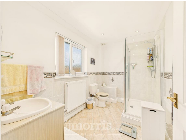
Comprising a W.C, wash hand basin set in vanity storage unit, shower enclosure, tiled flooring, part tiled walls, frosted double glazed window to rear, radiator and heated towel radiator.