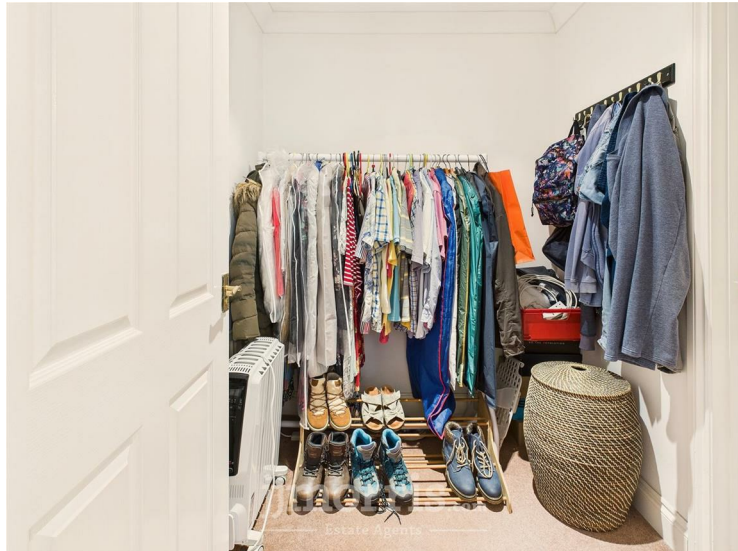
Space for hanging clothes etc, door leads on to: