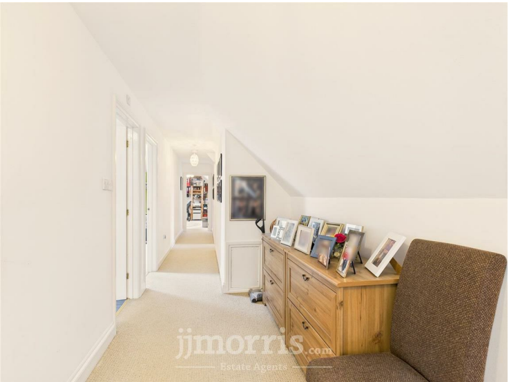
Spindle balustrade, double glazed windows to side and front, access to eaves storage space, doors open to: