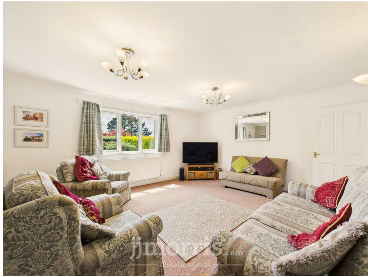
Double glazed window to front, radiator.