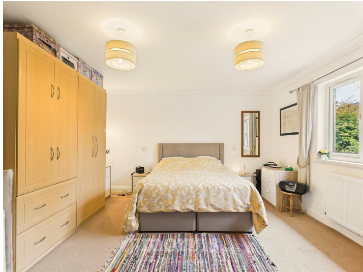
Double glazed window to front, radiator, door to: